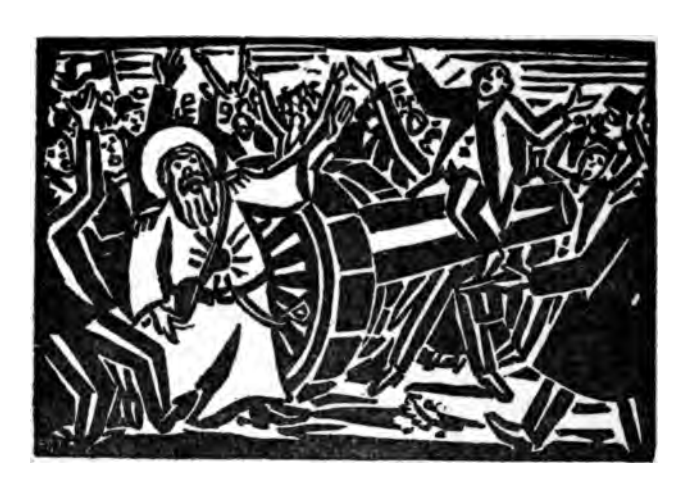
MASTER-GOD his voice is audible in the midst of the crowd before he can be seen.

Wait! My presence is the only thing wanting at your festival. Where the cannon's are, there am I. Present arms! Open your ranks!... Excuse me, my children, excuse me; it's me, it's God. Let me pass.